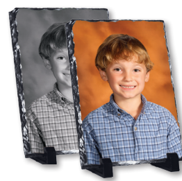
Photo Slate 5"x7" slate includes display stand. Choose Black & White or Color $15

Floating Metal Print Metal print floats 3/4" from wall. Includes wooden mounting blocks on back. 5"x7" $18